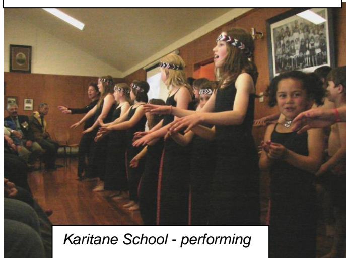
Karitane School - performing