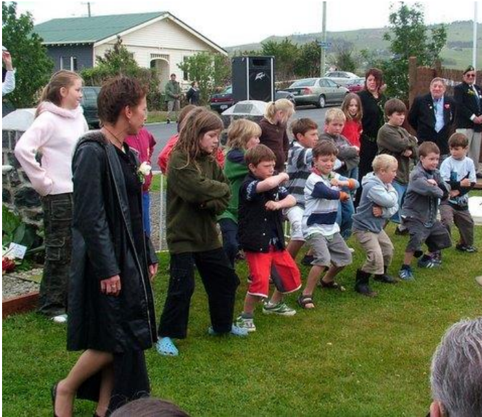
Karitane School performing the haka.